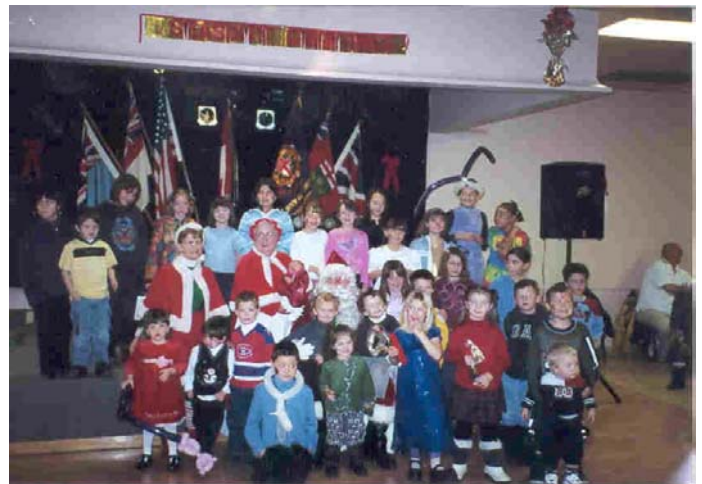
ANAVETS' Unit 342 in Cornwall, ON held its Children's Christmas Party on 14 December. 52 Kids receives gifts, hotdods, juices, candy canes, books, and crayons.

See the newspaper articles attached that came in from various units. It is great to see such stories and of what and how the ANAVETS' Association is doing for veterans, Canadians and communities across Canada. Well done to you all! Bravo Zulu!