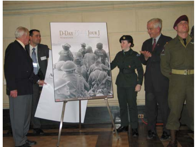
A D-Day veteran and an Army Cadet unveil the 2004 D-Day Poster on Parliament Hill with Minister McCallum looking on.

the ceremony. An electronic copy of the Poster of the 60 th Anniversary of D-Day can be downloaded from www.vac-acc.gc.ca .